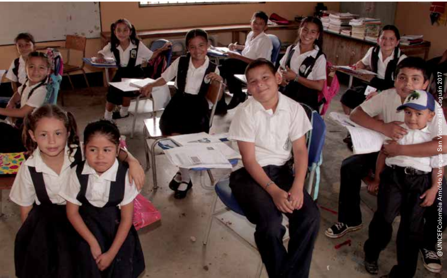
San Vicente del Caguán 2017

Incidency and advocacy efforts before the Ministry of Education in favor of rural education and ethno-education continued during the year